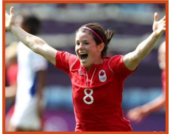
Diana Matheson after the winning

At the London Olympic Games this summer, Princeton alumni represented the Canadian Team very well. Diana Matheson '08 from Oakville, Ont., twice the Ivy League MVP in soccer, scored the winning soccer goal against France that earned the Canadians the Bronze Medal!