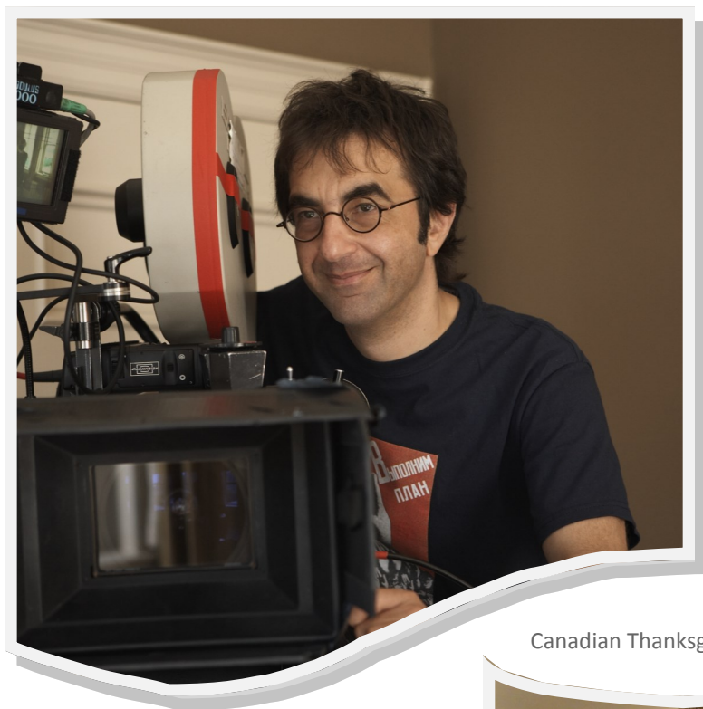
Canadian filmmaker, Atom Egoyan, our guest speaker in April 2012