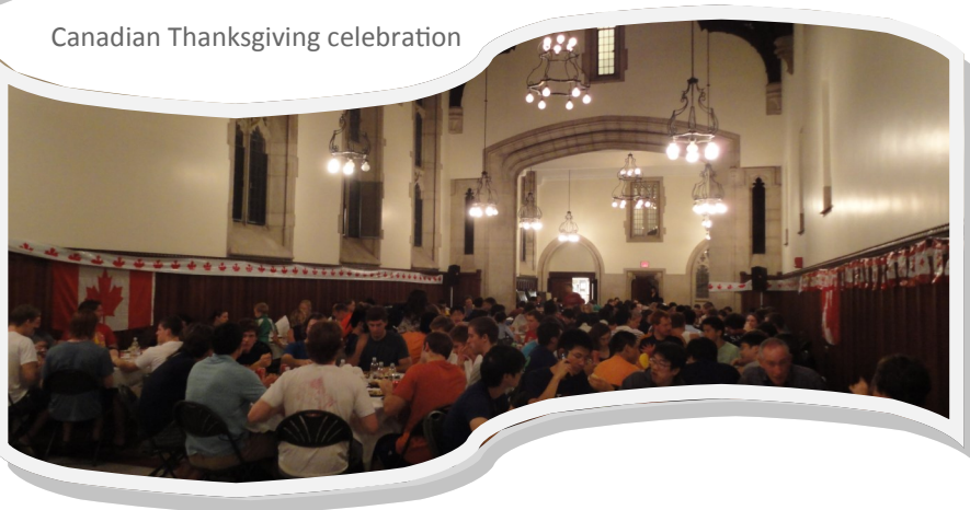
Canadian Thanksgiving celebration