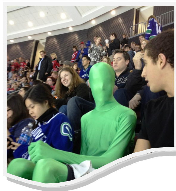
Eager students at the annual NHL outing at the Prudential Center, Newark for the NJ Devils vs. Toronto Leafs game