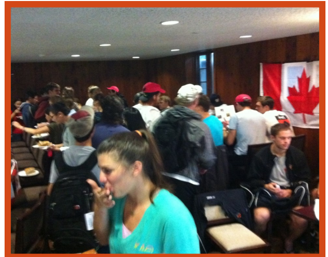
Welcome Luncheon 2011-12

Canadian Studies teamed up with the Princeton Canadians Club to offer a number of social events and activities for Canadians and other friends on campus. Per tradition, we invited new and old members of the Princeton Canadian community to the annual Welcome Luncheon in September at the start of the Fall semester. It was a great opportunity for Canadians on campus to meet over a delicious buffet lunch, in addition to learning more about the plethora of events and funding opportunities offered by Canadian Studies. Of course, attendees were also there to get their free Canadian Studies' t-shirts!