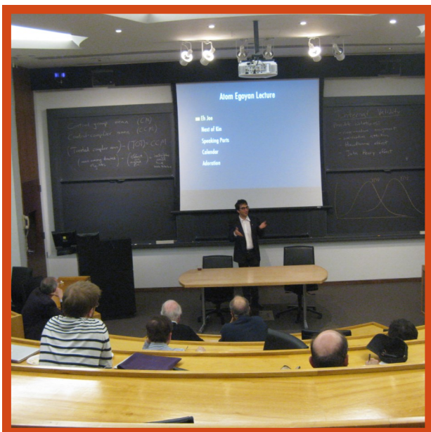
Egoyan lecturing at Robertson Hall

In April 2012, Canadian Studies proudly presented “Formations,” a lecture by the critically-acclaimed Canadian-Armenian filmmaker, Atom Egoyan . Winner of numerous awards – including five prizes at the Cannes Film Festival, two Academy Award nominations, and eight Genie Awards prizes from the National Board of Review – Egoyan is one of the most celebrated contemporary filmmakers on the international scene. At his lecture, he discussed the evolution of his impressive body of work and its unifying themes, which delve into issues of memory, displacement, and the impact of technology and media in modern life. Showing scenes from his onscreen adaptation of the Samuel Beckett play, Krapp’s Last Tape , starring John Hurt, Egoyan provided thought-provoking commentary about how he constructed the scenes. In addition to his lecture, Egoyan met with students in the Film Studies program at the Lewis Center for the Arts to share his experiences and insights as a filmmaker, as well as to provide feedback to the students on their projects. A recording of his lecture can be seen here: