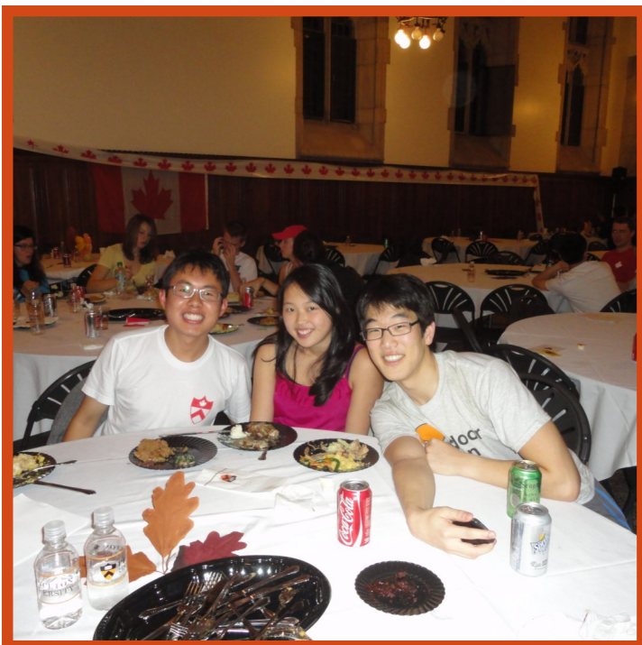
Eager and satisfied guests at the Thanksgiving Dinner

One of the highlights in our lineup of events is the much anticipated Canadian Thanksgiving Dinner held in October inside the beautiful dining hall of Mathey College. As usual, the complimentary feast drew a large and hungry crowd who, in the generous spirit of the season, donated canned goods for local families in need.