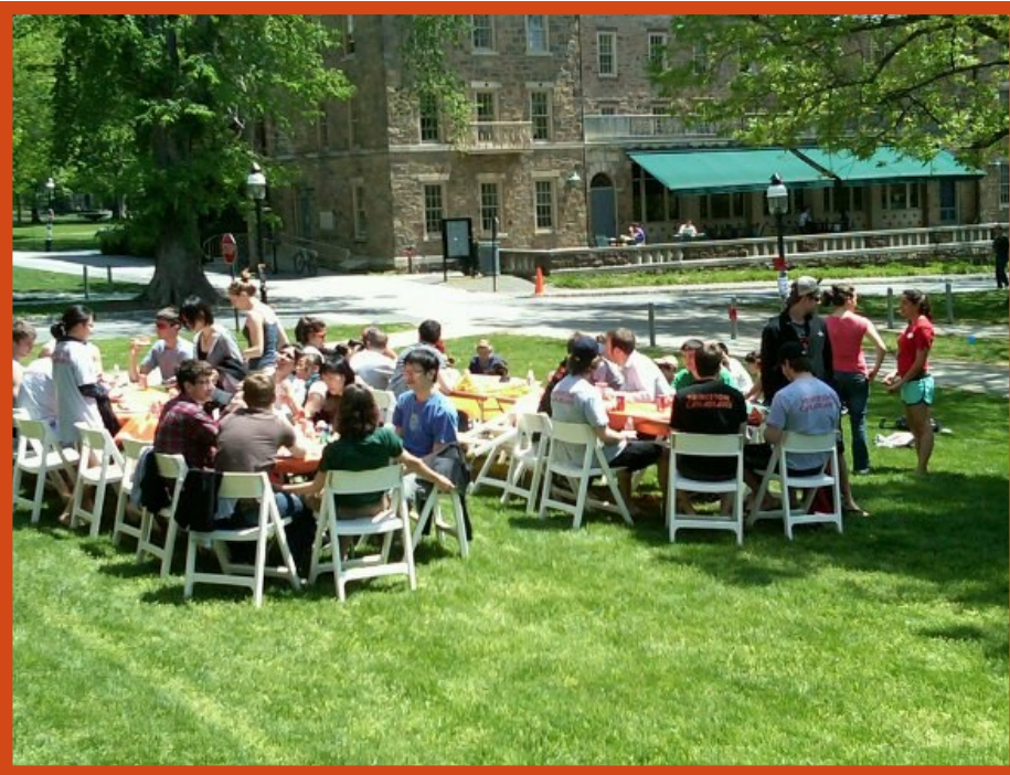
End of the year BBQ at Alexander Beach

Capping off another successful year, we held our annual end-of-the-year BBQ in May at the famed “Alexander Beach” on campus. An eager crowd of students, faculty and their families enjoyed a picnic of delicious foods and received complimentary t-shirts. The event provided a fun study break a week before final exams.